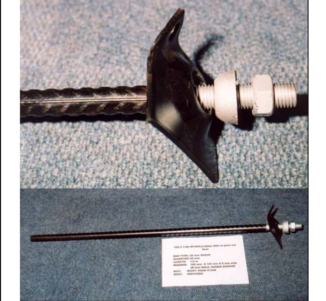
25 mm REBAR assembly with domed washer and spherical seat