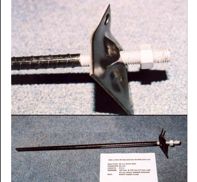
20 mm STEP BAR assembly with ribbed washer and plain nut